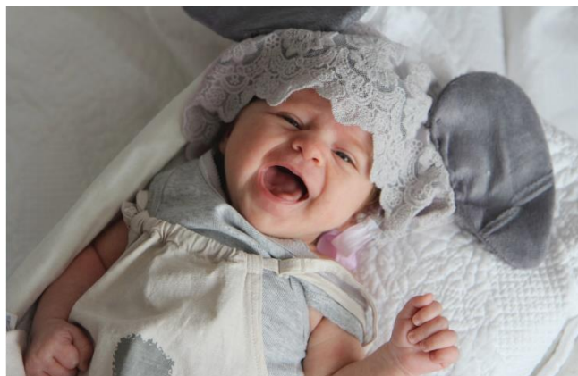
Baby McKenna Elephant Bird!