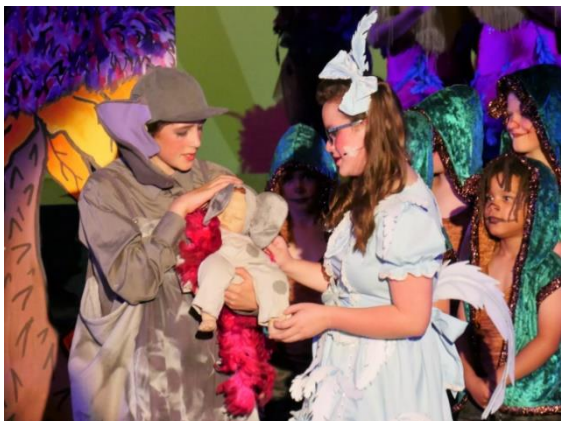
Seussical Elephant Bird